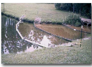
Figure 30. Particle curtains clarifying the input to a pond