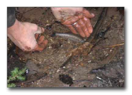
Figure 27. Salmon smolt swimming in the diversion ditch

spawning adults could be seen swimming in these waters. To protect the habitat, it was important to have this flocculation system in place before the construction project began.