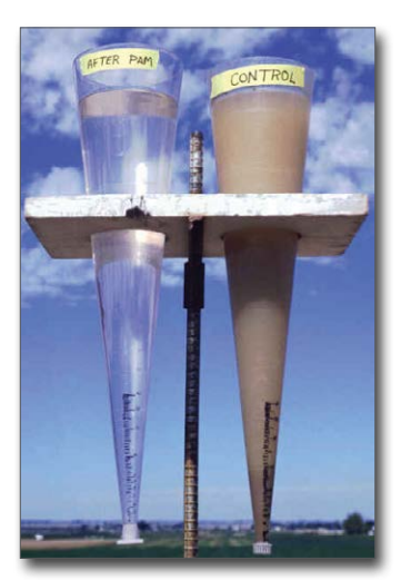
Figure 24. Comparison of water from furrows with and without PAM