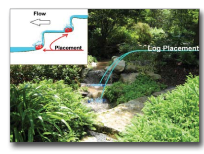
Figure 32. Polymer flocculant logs placed in the waterfall