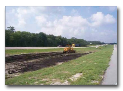
Figure 37. Recycling sediment along a highway