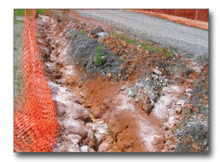
Figure 38. Eroding gully on a construction site

the site. Soluble polymer blocks were tethered inside a closed pipe (culvert) running under a construction road (Figure 39) that also drained to the pond. Before these BMPs were installed. the sediment pond was quite turbid (Figure 40). Two weeks after their installation and several significant rain events, the pond was clear, and only the sediment deltas remained (Figure 41). Designing polymer flocculation systems often involves using multiple BMPs and having them work well together.