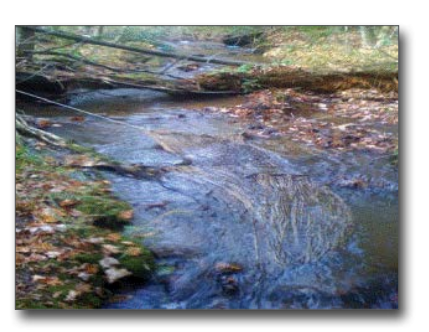
Figure 26. One of the in situ jute particle collection mats