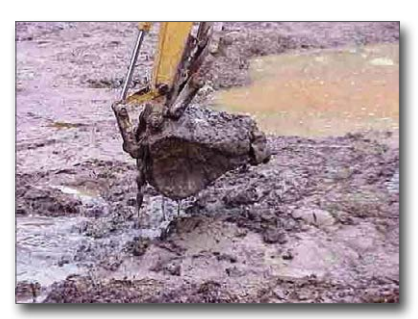
Figure 36. Removing stiffened sediment from a sediment basin

sediment will bind the particles together and stiffen it, making it easier to remove (Figure 36). This is done by spreading the granular PAM flocculant evenly over the sediment surface and then mixing it into the top three feet of sediment using the excavator equipment's bucket. Do not dump the flocculant in a pile. If the sediment is deeper than three feet, this mixing and removal can be repeated for each successive threefoot layer of sediment. The sediments removed may be recycled as topsoil (Figure 37).