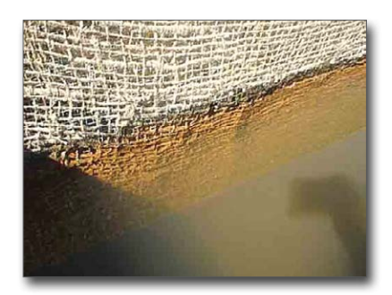
Figure 3. Matting used for floc collection

Floc collection becomes important if the stormwater runoff velocity is too high to allow the flocs to settle to the bottom. In these cases an attachment surface, such as the soft matting (jute, hemp, burlap, or coconut coir) shown in Figure 3, needs