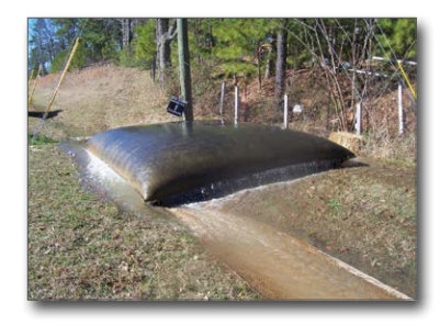
Figure 34. Sediment bag and its treatment ditch