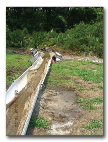
Figure 21. Split pipe with soft matting

Irrigation furrows. Applying polyacrylamide (PAM) to irrigation furrows improves the irrigation process by providing more water to the crops. As water flows down the furrow it infiltrates through pores in the sides and bottom of the furrow and into the surrounding soil. PAM binds the fine soil particles into aggregates (flocs), which are too large to clog these pores, and this increases the infiltration. Maintaining larger pores provides more water to the crops because infiltration rate increases exponentially with the diameter of the furrow's pores. The water