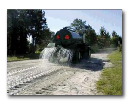
Figure 11. Water truck applying dissolved polymer flocculant

Dust control . The objective of dust control is to reduce airborne dust from haul roads, tailings piles, waste dumps, and open areas on construction sites. The polymer is mixed and dissolved in water and then sprayed directly on the road or other ground surface (Figure 11). A comparison