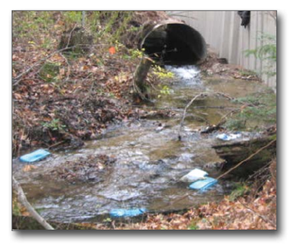
Figure 25. Six of the polymer blocks placed downstream

to be replaced during a fall salmon run. Before this construction project began, water soluble, polymer flocculant blocks were placed in the river 20 to 30 feet downstream of the culvert (Figure 25) to protect the spawning ground from turbidity. Jute matting was placed downstream of the polymer blocks (Figure 26) to collect the flocculated soil particles. Before the old culvert could be removed, a channel had to be dug to divert the flow around the construction site. The diversion channel was lined with plastic and crushed limestone. which was covered with polymer powder to prevent white plumes of lime sediment from drifting downstream. This flocculation successfully clarified the water in the diversion channel and in the river below the construction site. Little salmon smolts (Figure 27) as well as