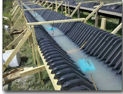
Figure 17. HDPE treatment ditch liner