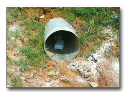
Figure 39. Polymer block in a construction site culvert