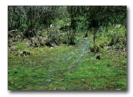
Figure 10. Clarified dredge spoils returning back to the lake

into a Tennessee Valley Authority lake. The dredge spoils were initially pumped into a settling pond to allow the heaver particles to settle. Then after passing through the mixing ditch in Figure 8, they entered an 8,100 square foot dispersion field (Figure 9) lined with jute matting, which was covered with a powdered polymer flocculant. After passing over a dispersion field and through a sediment retention barrier. the clarified water was returned to Kentucky Lake (Figure 10). The dredge spoils pumped into the settling pond were 15% solids. After settling, the water discharged from the settling pond had a turbidity ranging from 500 to 600 NTUs. And after flocculation in the treatment ditch followed by additional