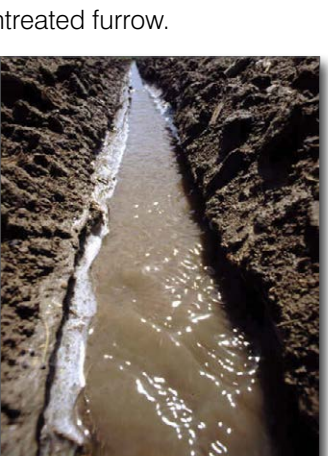
Figure 23. Untreated furrow with erosion

roughness and infiltration reduce the furrow's erosion and sediment transport. Figure 22 shows a furrow treated with PAM having little erosion and clear water. Figure 23 shows an untreated furrow having erosion and cloudy water. Imhoff cones in Figure 24 compare the turbidity in these two furrows. The cone on the left holds water from the furrow treated with PAM; the cone on the right holds water from the untreated furrow.