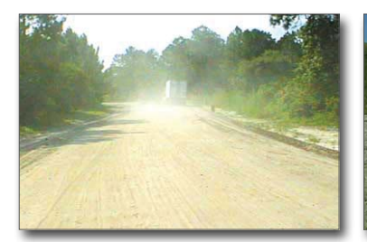
Figure 12. Road dust before applying polymer flocculant

of construction site road dust before and after polymer flocculation is shown in Figures 12 and 13. Using a flocculant to bind the dust particles will also reduce the amount of water needed to spray dusty construction areas.