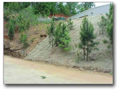
Figure 4. Slope covered with floc collection matting

of wind or water and to promote revegetation following a soil disturbing activity such as construction. Soft matting can be applied over the ground (Figure 4) to provide an attachment surface for floc collection as runoff flows down the slope. If hydroseeding is used, the addition of a polymer flocculant in liquid form to the hydroseeding mix will bind the seed, fertilizer, and other additives to the soil until the new vegetation is established. The hydroseeding mix is then sprayed on the slope (Figure 5), and vegetation is established to stabilize the slope (Figure 6). When hydroseeding is not used, the powdered polymer can be applied by hand over the matting. When it rains, the powdered polymer dissolves and the soil particles become