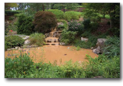
Figure 31. Newly constructed water garden

Dewatering sediment basins . When settling ponds or basins need to be dewatered, the water can be pumped through a sediment bag, which traps the coarse sediment