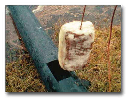
Figure 19. Polymer blocks inserted into pipes

Closed pipes. The construction site for a large number of homes near Disney World was drained because it was originally marsh land. The contractor pumped the water over a quarter of a mile through closed pipes to a natural lake. To prevent the lake from