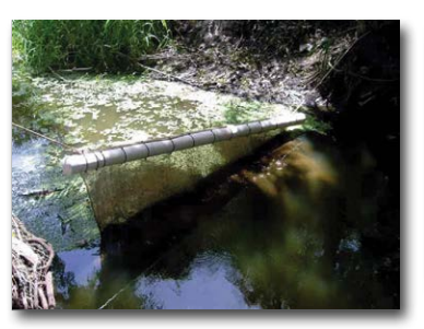
Figure 29. Particle curtain in a canal

Particle curtains. After suspended sediment particles are bound to the flocculant in flowing waters, if the velocity is too high to allow the flocs to settle to the bottom, then particle curtains of jute or other soft matting can be suspended from floats across the current, to collect the flocculated particles. However, particle curtains are not a stand-alone BMP. They must be placed just downstream of a polymer flocculation system. The particle curtain shown in Figure 29 is being lowered into a canal in central Florida. Three particle curtains in Figure 30 are placed across the inflow to a pond. Each curtain reduces the inflow's turbidity.