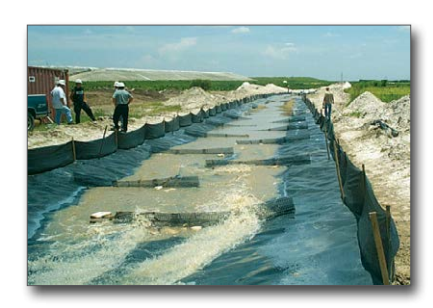
Figure 16. Flocculation ditch with checks to increase the polymer mixing

The treatment ditch used to clarify stormwater runoff from a highway construction site (Figure 17) has deeply corrugated sides that create turbulence which facilitates flocculation by mixing the polymer flocculant with the turbid stormwater. The ditch is made of high density polyethylene (HDPE) sections that can be disassembled and reused on other projects or recycled. These sections eliminate the need for the hay bales and plastic linings, they reduce the amount of construction material taken to municipal landfills for disposal, they will stack tightly for transporting to another job site or storage, and they can also be