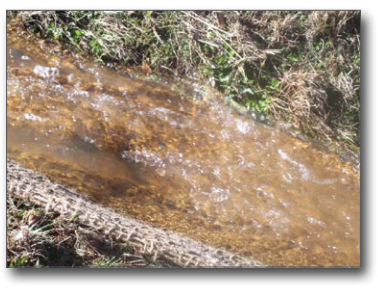
Figure 35. Clarified discharge water near the end of the treatment ditch

particles. Jute matting covered with powdered polyacrylamide flocculant placed under the sediment bag and along its discharge ditch (Figure 34) will clarify the discharge water by flocculating the fine sediment particles that pass through the bag and binding them to the soft matting. The discharged water in Figure 35 is much less turbid than the water leaving the sediment bag.