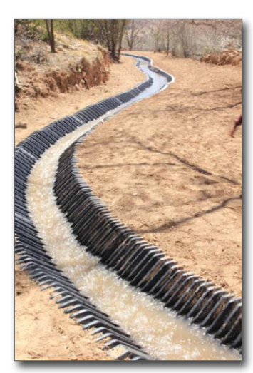
Figure 18. In-ground treatment ditch

used to line in-ground treatment ditches (Figure 18). They're a green product made of about 75% recycled material.