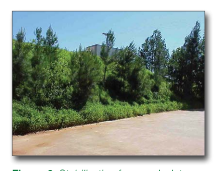
Figure 6. Stabilization four weeks later

chemically bound to the long polymer molecules. The resulting flocs are sticky and adhere to the fibers of the soft matting to create a highly erosion resistant surface that supports vegetation. If straw or mulch is used instead of soft matting to cover the ground, the flocs will also adhere to either of them and provide good erosion resistance and revegetation support.