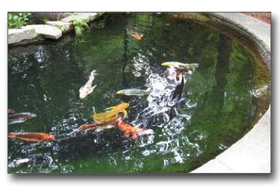
Figure 33. Coi pond two days later