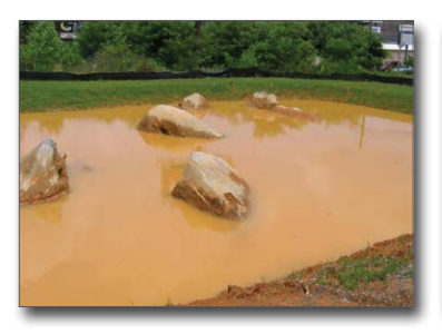
Figure 40. Sediment pond before BMPs were installed