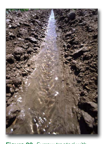
Figure 22. Furrow treated with PAM