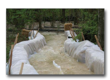
Figure 8. Large mixing ditch

A much larger dispersion field was needed to clarify the spoils from a dredging operation before they were discharged back