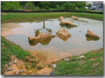
Figure 41. Same pond after BMPs were installed