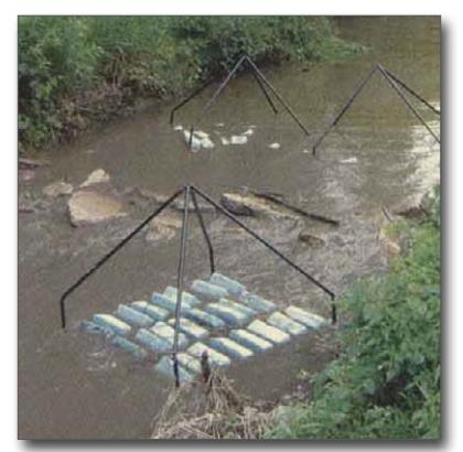
Figure 28. Three in-stream baskets

spawning adults could be seen swimming in these waters. To protect the habitat, it was important to have this flocculation system in place before the construction project began.