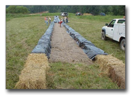
Figure 15. Lower portion of the treatment ditch