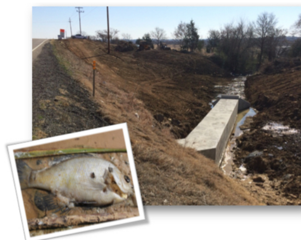
OKLAHOMA DOT PROJECT CLEAN WATER ACT NON-COMPLIANT

It's compliance with the National Pollutant Discharge Elimination System (NPDES) of permits, with enforcement to back it up, that changed America's