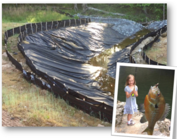
GEORGIA DOT PROJECT CLEAN WATER ACT COMPLIANT