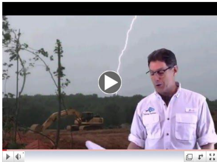
Video to the 2016 Changes to the GREEN BOOK