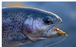
FISH WITH KIDS!