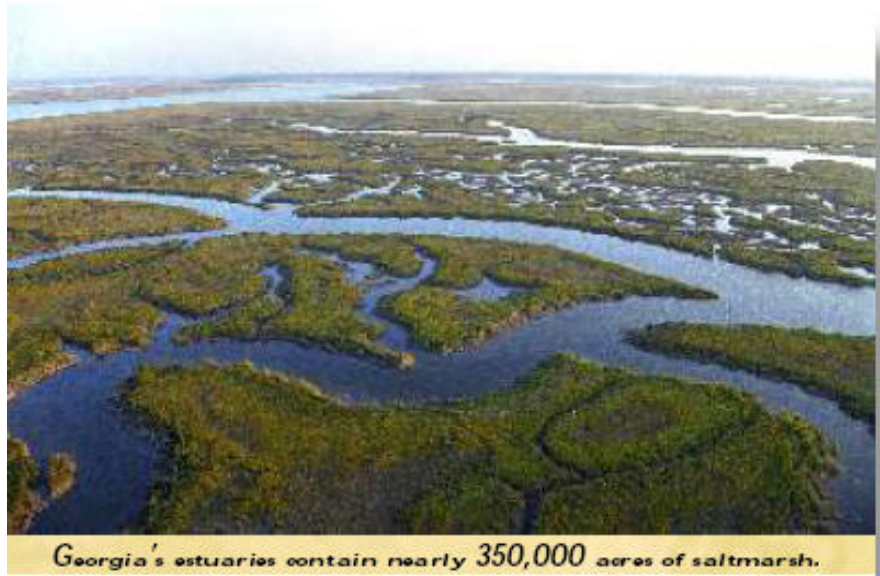
Georgia's estuaries contain nearly 350,000 acres of saltmarsh.

Georgia's law protecting waterways from encroachment by construction projects does not apply to marshes and wetlands, the state Supreme Court ruled Monday.